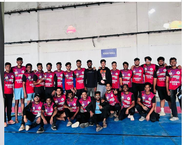
Sinhgad College of Architecture- Boy's Cricket and Kabaddi Team