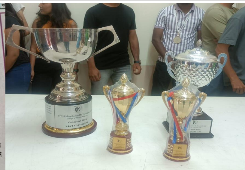
Photo of Trophies