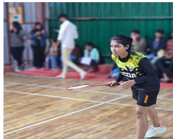
Girl's Singles Badminton Tournament

The Sport's Event of Euphoria was organised by Aayojan School of Architecture and Design, Pune. They organised three games of Badminton (Singles and Doubles), Futsal and Box Cricket. They were organised for the dates of 28th, 29th and 30th of December 2023.