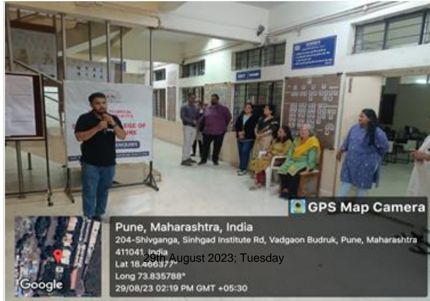
Students hosting the event