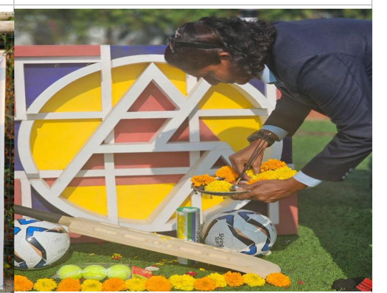
Inauguration of Event by Chief Guest