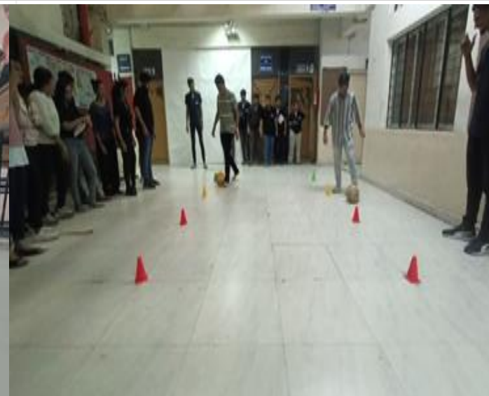
Students competing for Football dribble