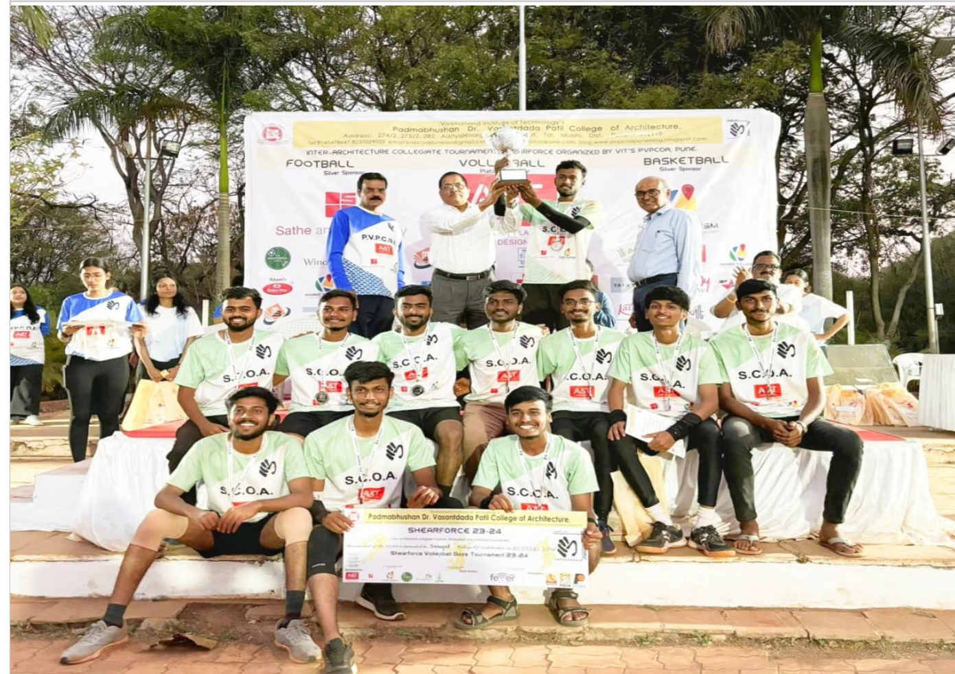
2nd Winner: Boy's Volley Ball Team