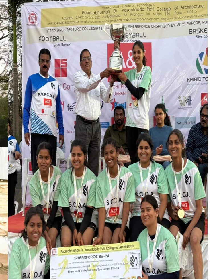
1st Winner: Girl's Volley Ball Team