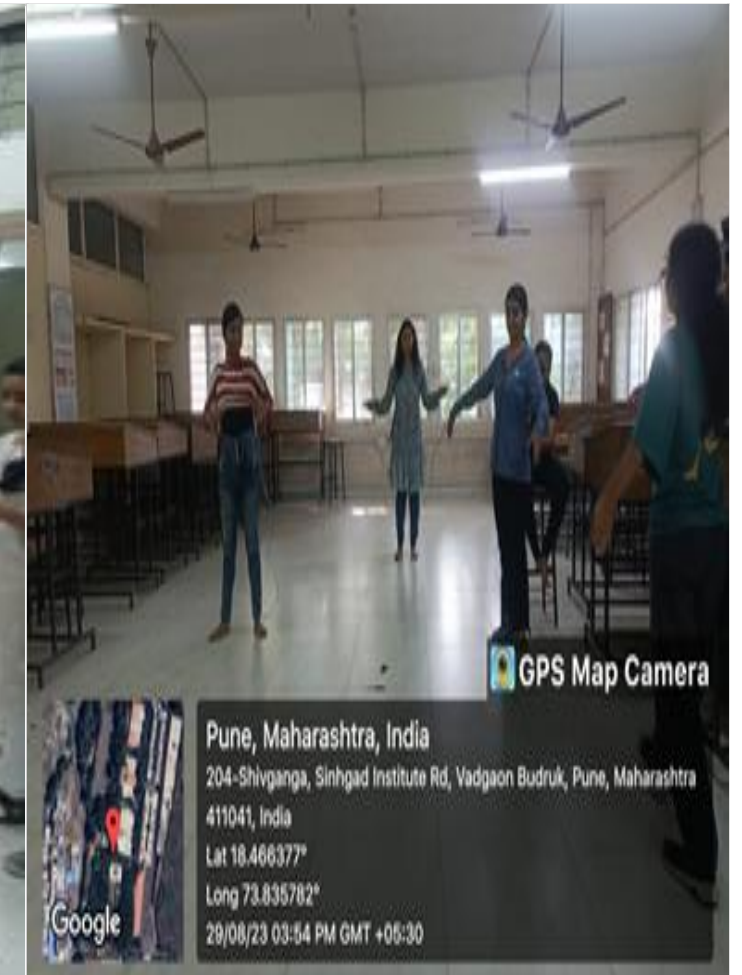
Students competing for Skipping