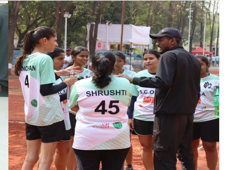
Ongoing Girl's Volleyball Match timeout