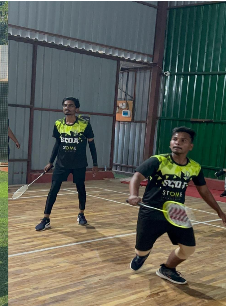
Boy's Doubles Tournament for Badminton