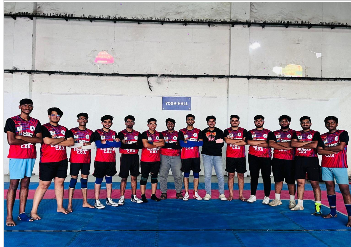
Sinhgad College of Architecture- Boy's Cricket Team