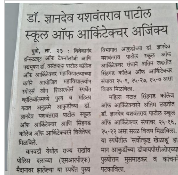
Newspaper article in Sakal paper on 24th March 2023

Sinhgad College of Architecture had taken part in it and won Gold medal for Volleyball girls and Silver medal for Volleyball boys matches