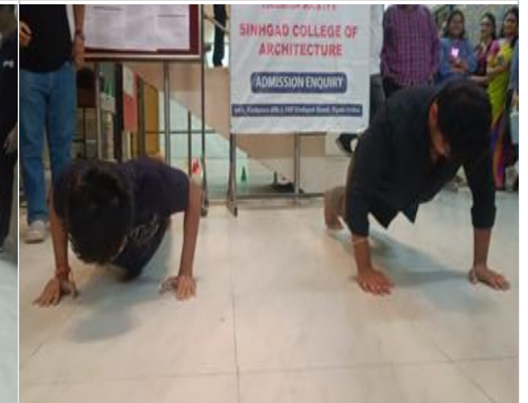
Girls competing for the Push up challenge