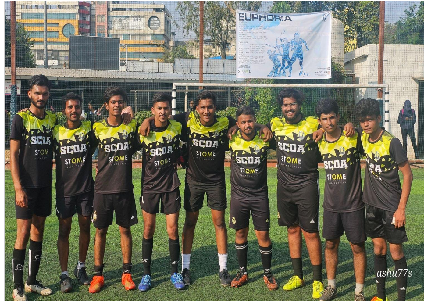
Boys Football Team for Sinhgad College of Architecture