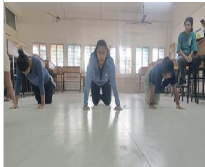
Girls competing for the Push up challenge

Organised for all year students of B.Arch and M.Arch by Sports co-ordinators (faculty & students). 3 different indoor games were shortlisted and all students as well as teaching and non-teaching faculties can participate if interested. Accordingly, participation entries were collected from students and a schedule was prepared. Common rules were prepared for all games and explained to the participants before the games. The games organised were Football Dribble, Push up challenge and Skipping where stamina of the students and faculty were tested.