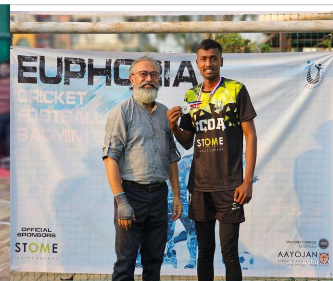
Runner up winner for Boy's Singles Badminton