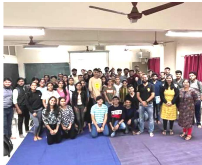
Students attendance for the workshop