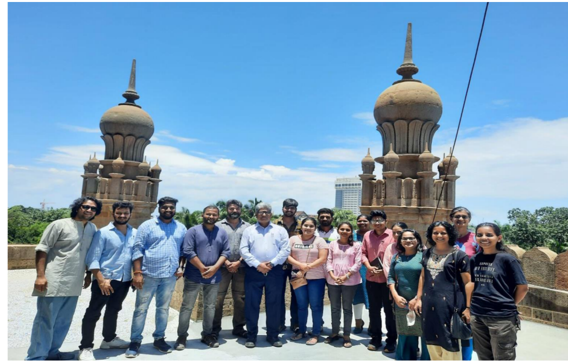
The Workshop was attended by F.Y.M.Arch (Sem 2) students, and M.Arch (AC) department Faculties