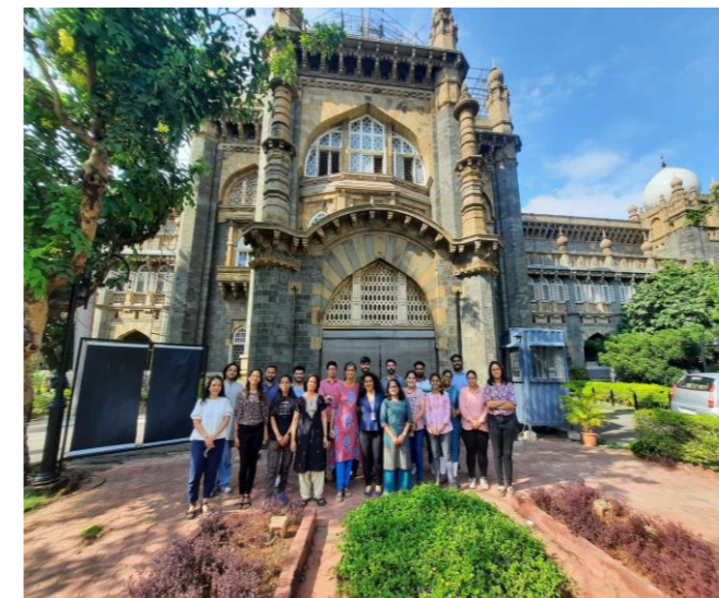
Glimpses of the workshop