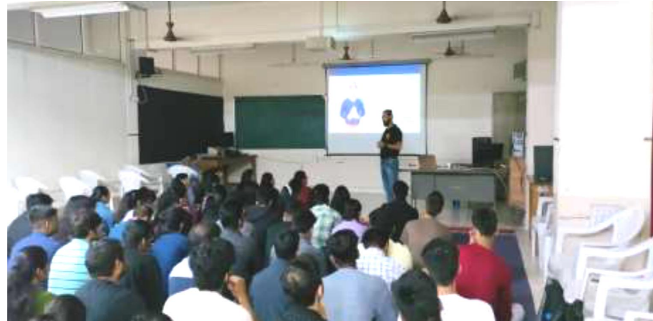
Students engrossed in the presentation

Features like Artskills World for curated videos on architecture; Artskills Talk will showcase enlightening discussions on various aspects of architecture, internship & career opportunities and relevant talent search for professionals, competitions and events, connecting all institutes with dedicated space for greater visibility and information sharing, world architecture news updates on this unique platform.