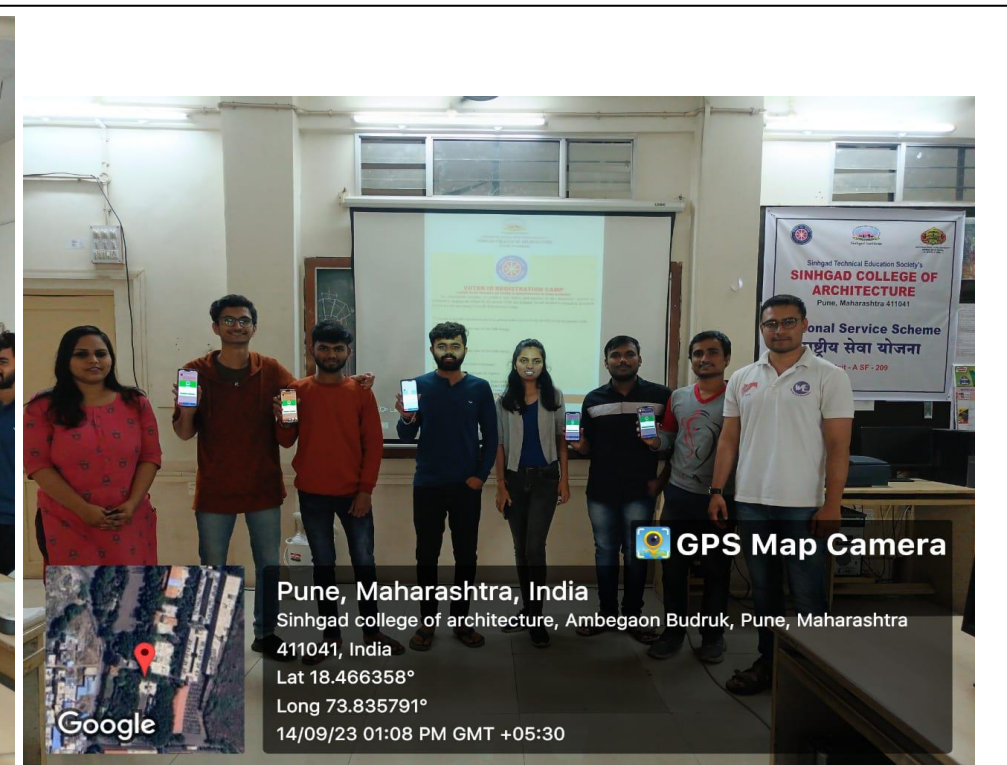
4 th Year Students New Voters ID registration.