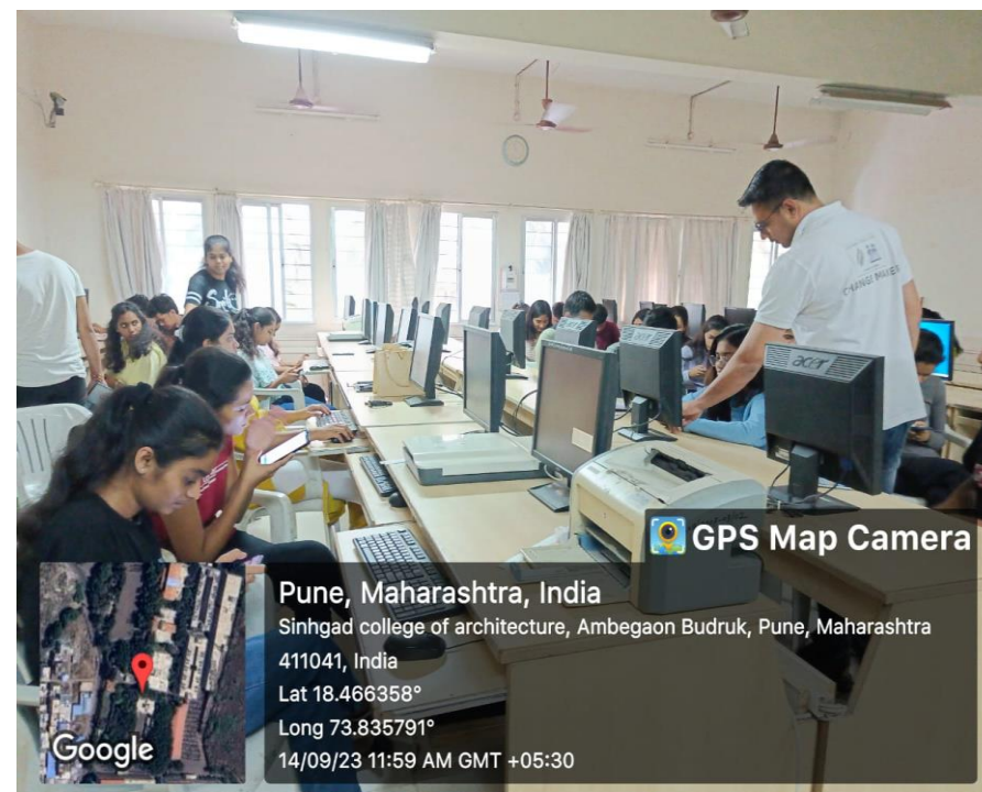
NSS Coordinator and Nodal Officer explaining the process of online Voters ID registration to students.