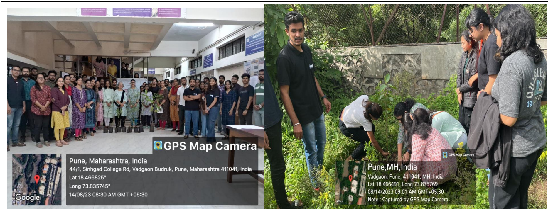
SCOA Faculties and Students Representatives at Tree Plantation Event.