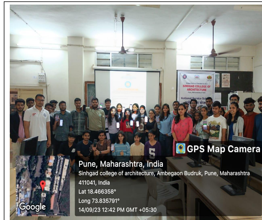
2 nd Year and 3 rd Year Students New Voters ID registration

Sinhgad College of Architecture, Pune organized Voters Registration Drive for New Voters on 14 th September 23, from 10:00 am to 4:00 pm. The campaign was held at the Computer Lab 1, witnessed active NSS volunteers aiding in the registration process. A Total 90 students registered for new voters ID from 2 nd Year, 3 rd Year and 4 th Year classes, streamlining and strengthening the democracy. Students were encouraged to bring the necessary documents and register to exercise their democratic right.