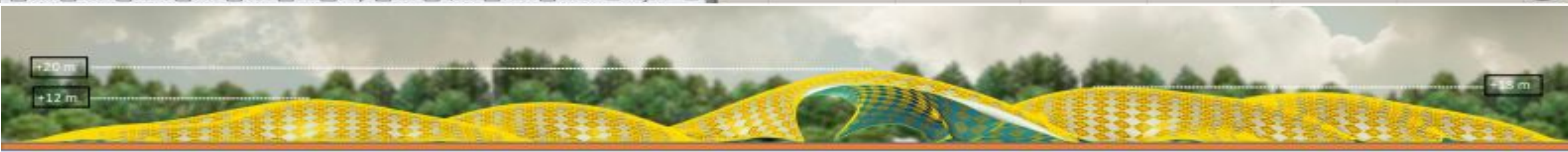
Front side Elevation