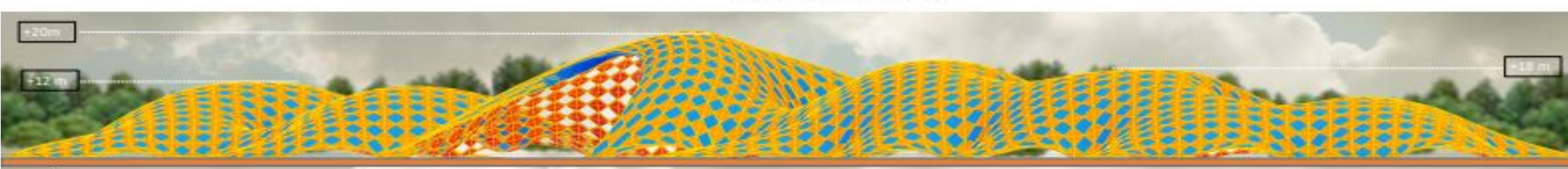
Rear side Elevation