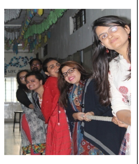
TUG OF WAR – FACULTY