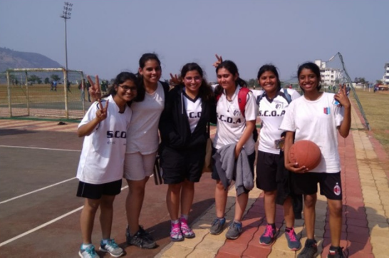
Sinhgad Sports Karandak