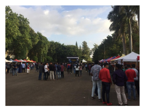
Sinhgad Carnival: for Freshers' welcome