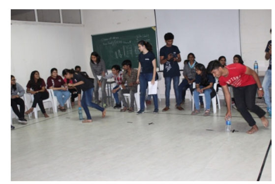
UNCONVENTIONAL GAME – STUDENTS