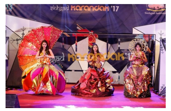
NEON: Sinhgad Cultural Karandak