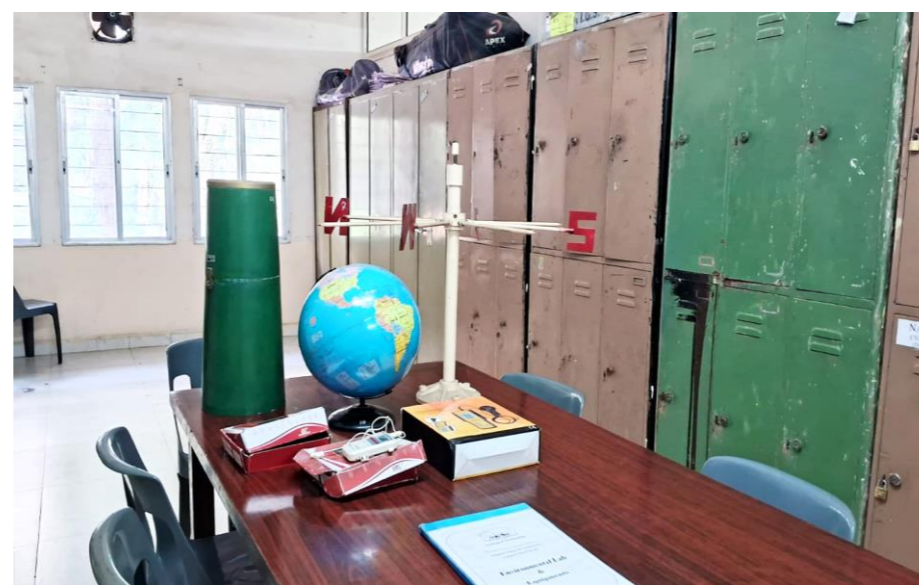
Photo of Climatology and Environmental lab