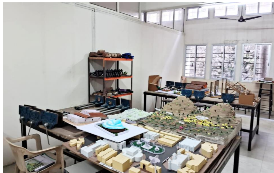
Photo of Carpentry Workshop Lab