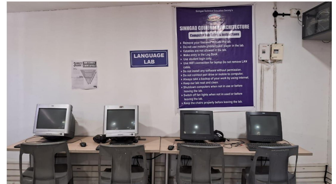
Photo of Language lab