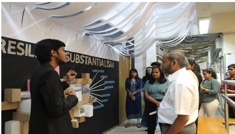
Student explaining about the theme and the mural to the guest.