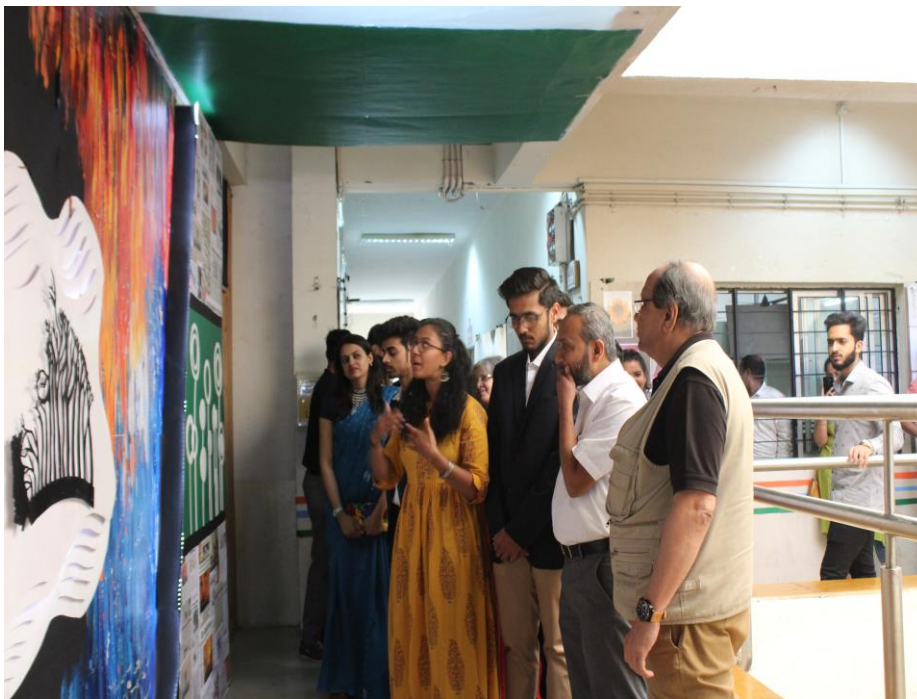
Guest interacting with the students at panel in corridor.

The exhibition panels were made from many recycled papers and sheets were used along with models to make murals adhering to the theme. As the college follows the green practices lot of minimum wastage of paper and reusing the paper.