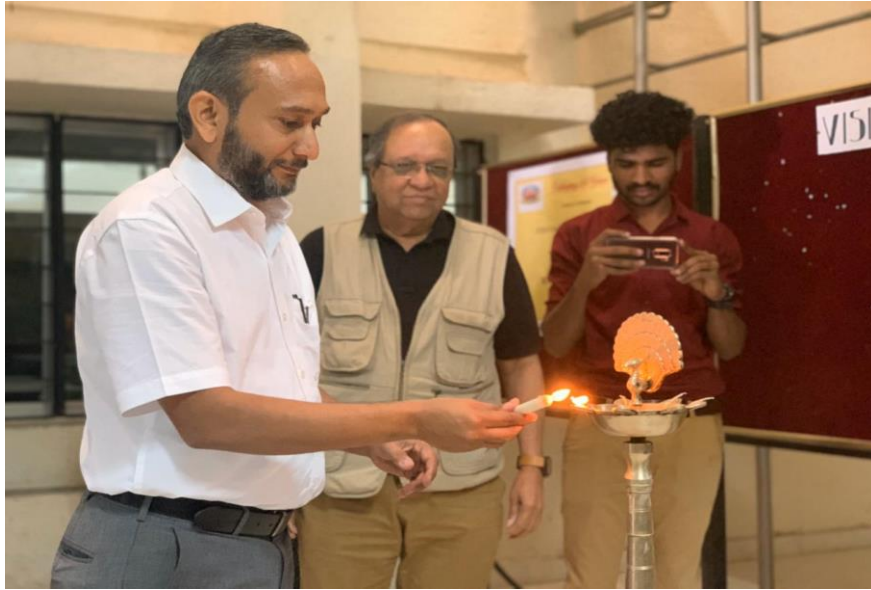
Guest inaugurating the exhibition by lighting the lamp.

44/1, Vadgaon (Budruk), Off Sinhgad Road, Pune 400 041. Telefax: 020-2435 1439 Email:scoa@sinhgad.edu