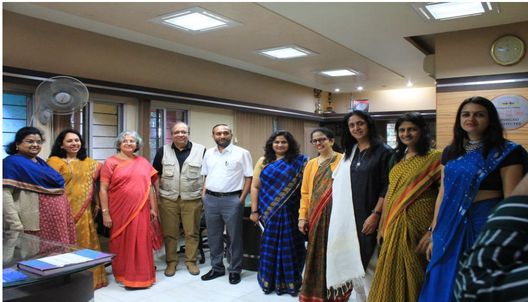
Guest of honour with Principal madam and other staff of the college.