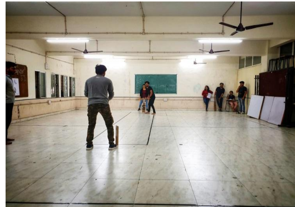
Sport 1 – Box Cricket