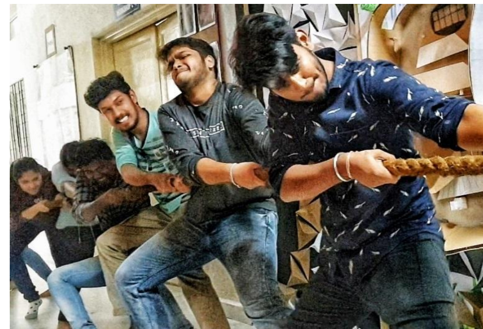
Sport 3 – Tug of War