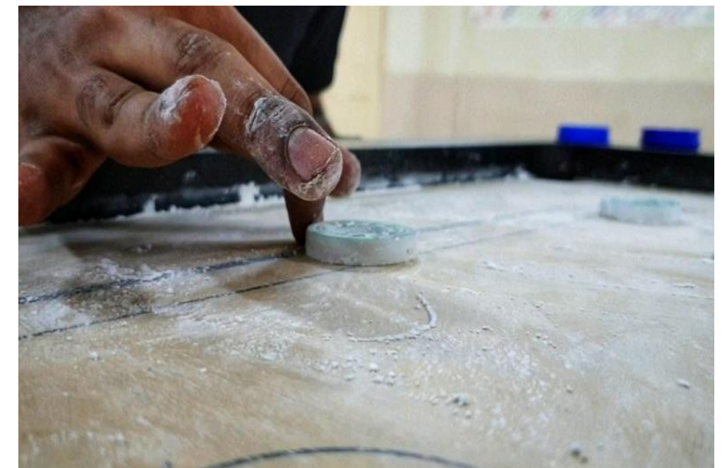
Sport 4 – Carrom