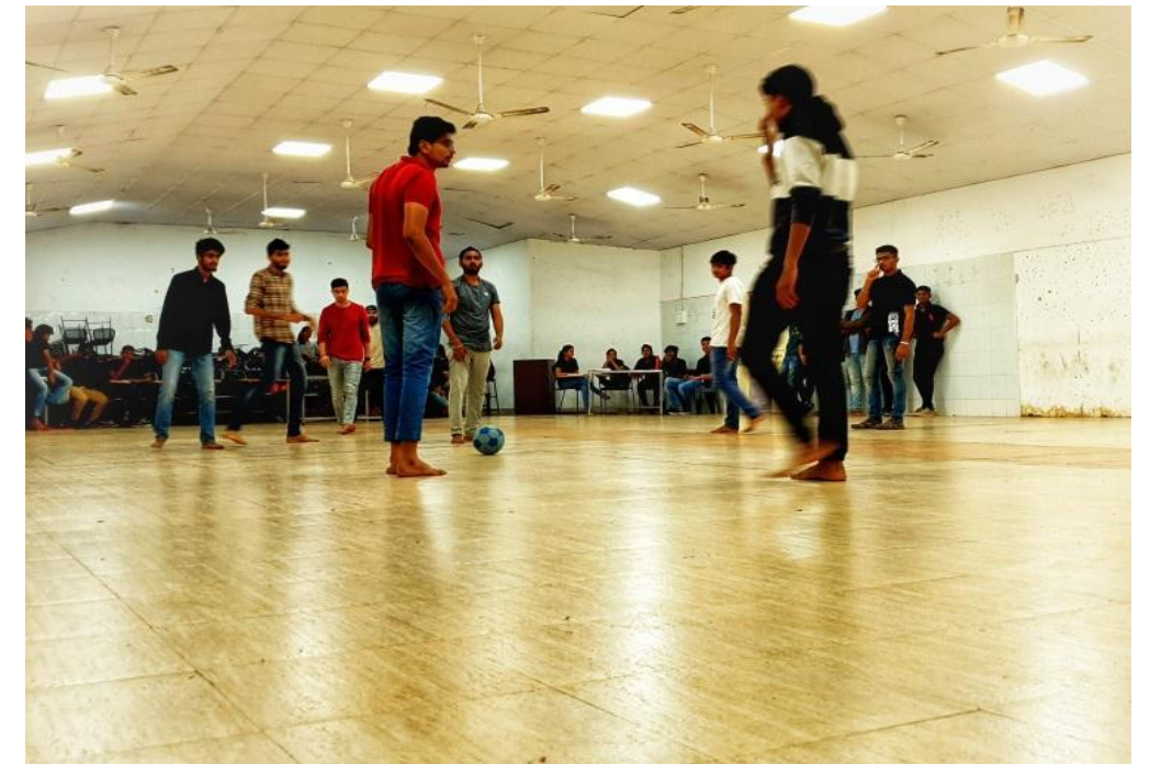
Sport 2 – Box Football